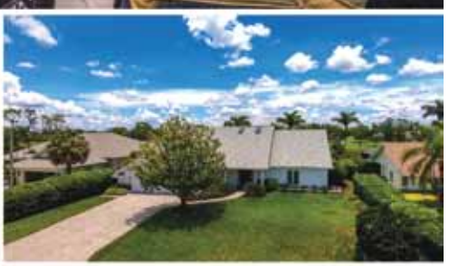
Imperial Golf Estates - 2240 Imperial Golf Course Blvd 4BR/3BA | Listed at $829,900

Remodeled & updated home with expansive lake & golf course views. All new COREtec flooring throughout, lovely granite, SS appliances, pavers on lanai & much more.